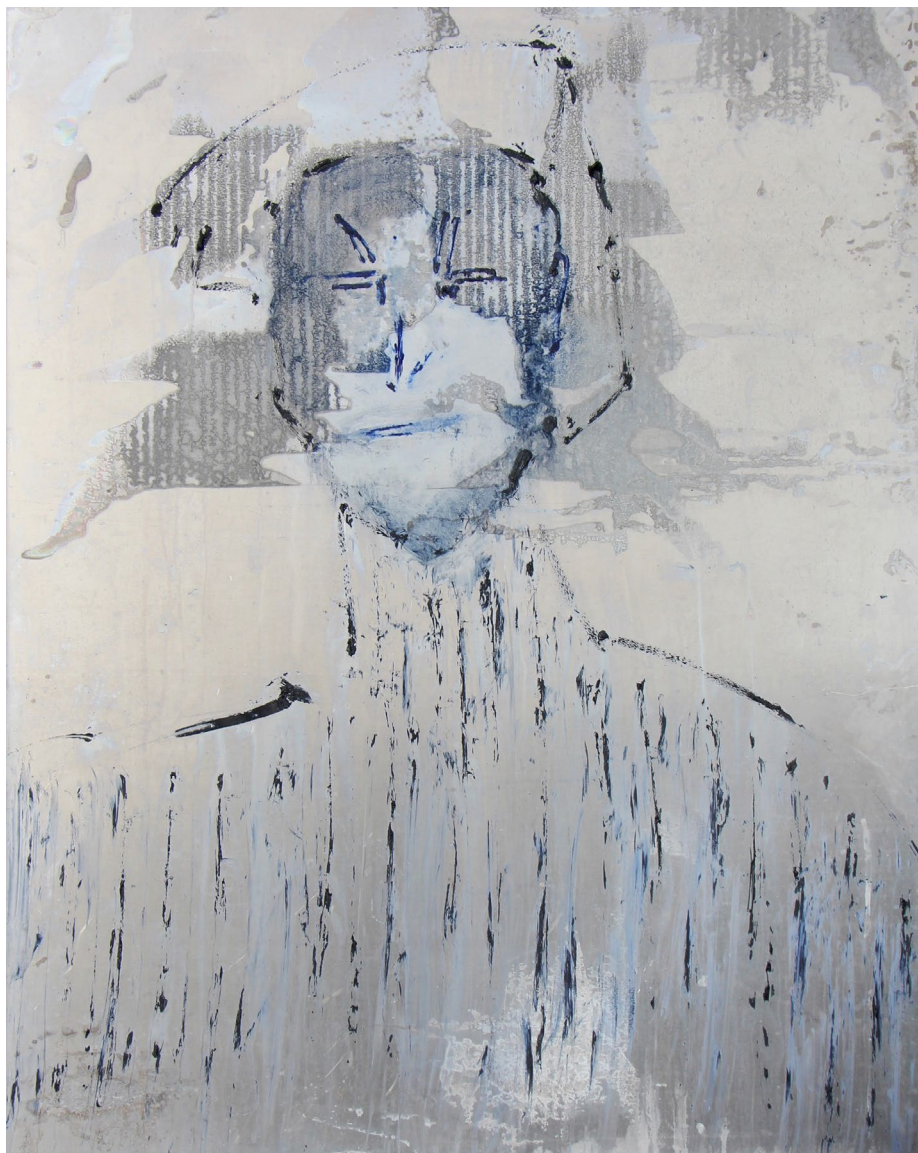
80 x 100h cm 2022 Oil paint on Aluminium