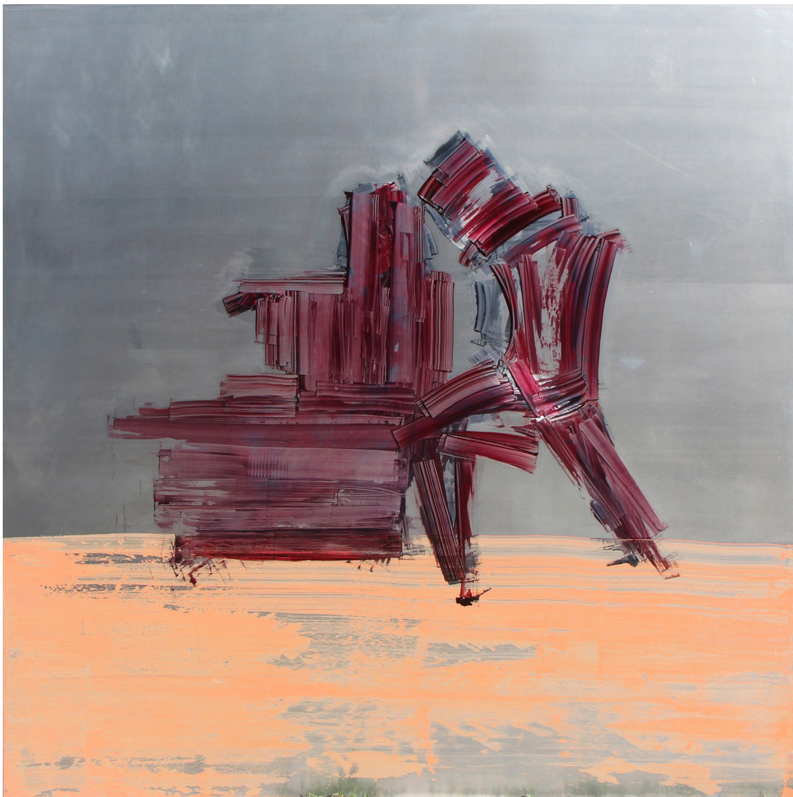
125 x 125 cm 2023 Oil paint on Aluminium