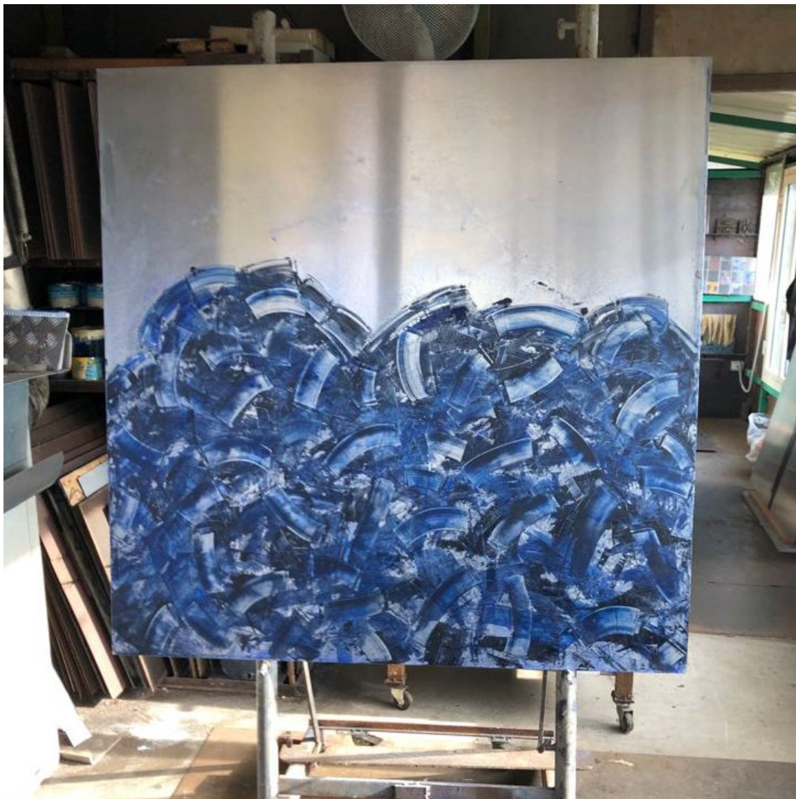
125 x 125 cm 2023 Oil paint on Aluminium