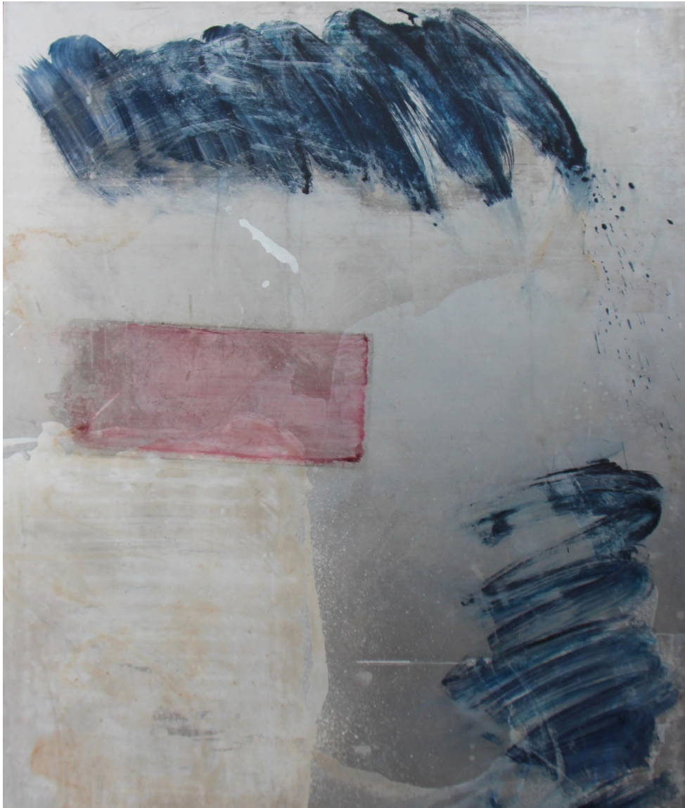
85 x 100h cm 2021 Oil paint on Aluminium