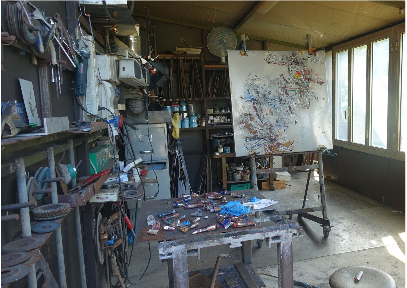
The working studio